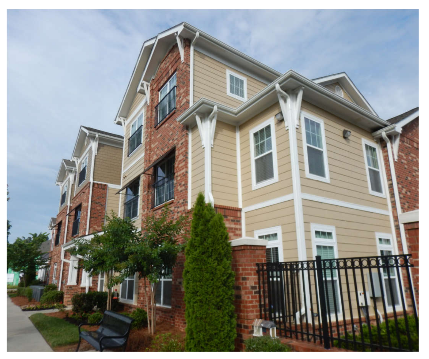
Construction Field Guide For 2019 NCHFA-Financed Rental Properties